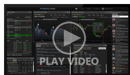
The Trend is Friendly For Now