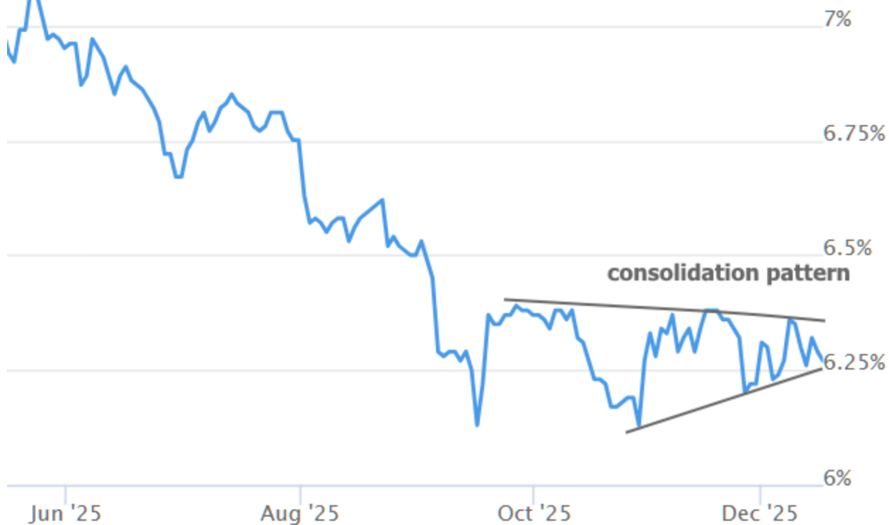
MND 30yr Fixed Mortgage Rate Index

Volatility remains a risk as the week progresses. If there's one additional report the market may be waiting to see before trading today's jobs report more aggressively, it's this Thursday's Consumer Price Index (CPI). This is the heaviest hitting monthly inflation report and inflation is the other half of the Fed's rate-setting equation.