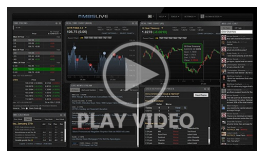
Wild Ride For MBS as Traders Digest New Developments