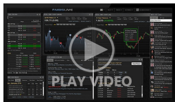
AM Gains Mostly Stick Around