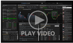
Early Gains. Flat Afternoon. MBS Underperform