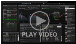
Hormuz Back in The News